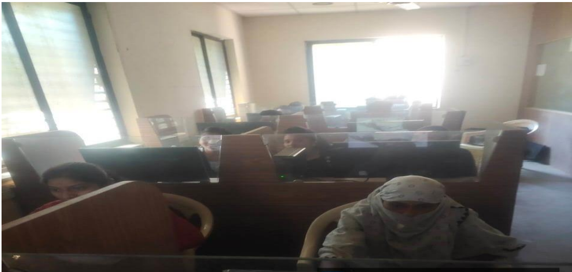
Student of the course are taking training of the Language Lab course in programme