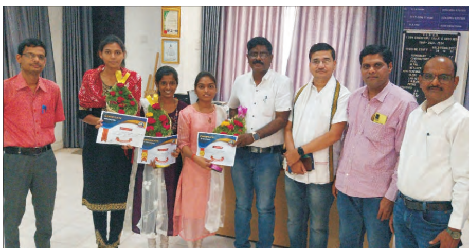
Felicitatation of students for success at National Level Poster Presentation Competition in Microbiology