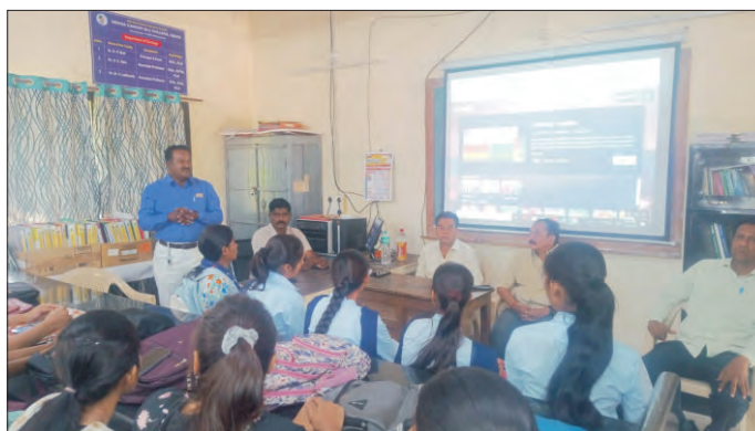
Online Quiz Competition-Zoology Department

Lab - Assitant Lab - Attendent Lab - Attendent Lab - Attendent Lib.- Attendent Lab - Attendent Peon