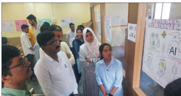
Poster Presentation on National Science Day