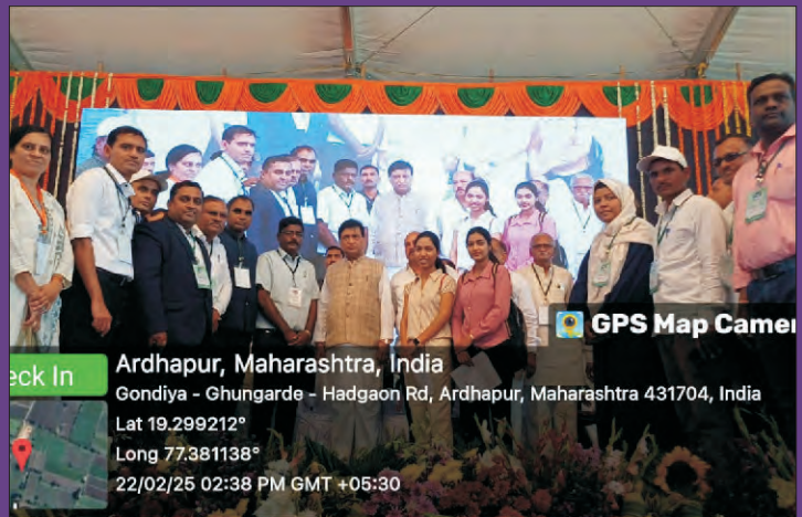
Job Fare held at SCM, Ardhpur on Dt.22/2/2025