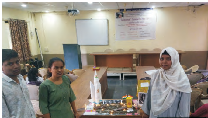
Model Presentation on National Science Day