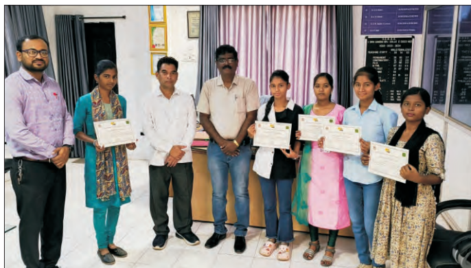
Participation of Students in RCMK-2025

7) Student Aid Forum : College started student aid forum from the academic year 2004-05, for those students who are academically bright but could not cope up with financial grounds. College initiates the funds to encourage those students for academic and personal development through this forum. By exemption of partial or full college fee for 15 students, college pays the examination fee for 10 students, Teacher - guardian will take care of 10 students, providing stationary such as practical record books, note books and set of books for 10 students, providing special facilities for disabled students.