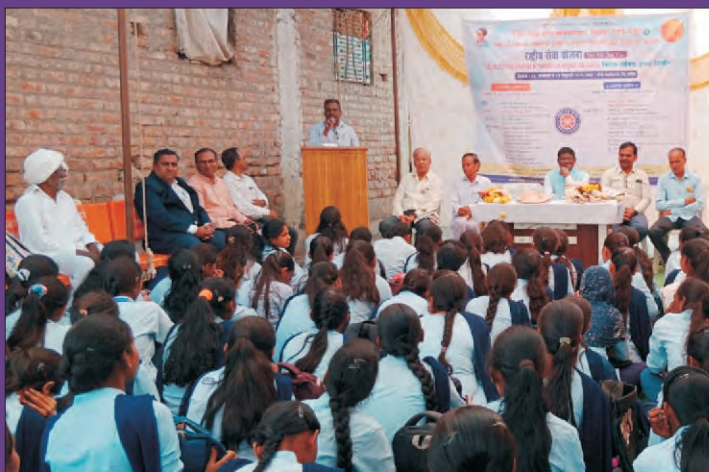
NSS Programme of Indira Gandhi (Sr.) College, CIDCO, New Nanded