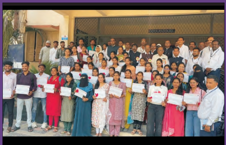
Degree Distribution Programme of Indira Gandhi (Sr.) College, CIDCO, New Nanded