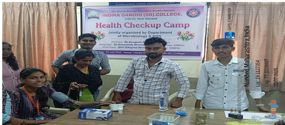
Blood Pressure check up of students