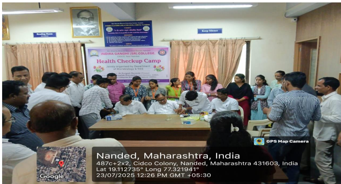
Health check up of chief guest and inaugurator by students of microbiology