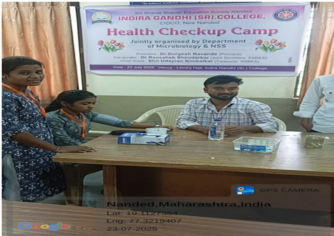
Blood Pressure checkup of students