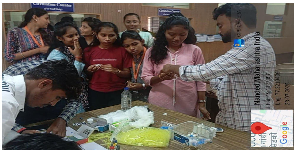
Blood Sugar checkup of students