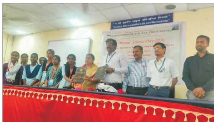
National Science Day celebration