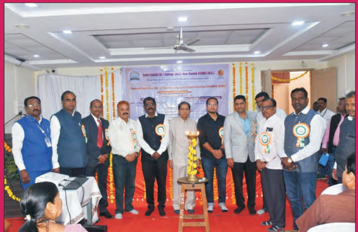
Inauguration of One Day National Seminar on Humanities in the Age of AI: Challenges and Opportunities (31 st January 2026)