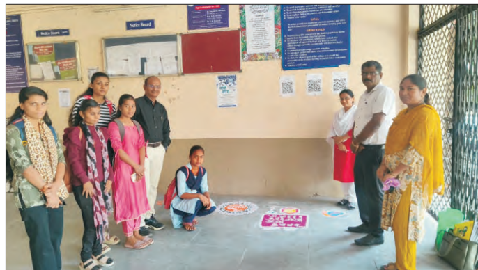
Celebration of Marathi Bhasha Din

7) Student Aid Forum : College started student aid forum from the academic year 2004-05, for those students who are academically bright but could not cope up with financial grounds. College initiates the funds to encourage those students for academic and personal development through this forum. By exemption of partial or full college fee for 15 students, college pays the examination fee for 10 students, Teacher - guardian will take care of 10 students, providing stationary such as practical record books, note books and set of books for 10 students, providing special facilities for disabled students.