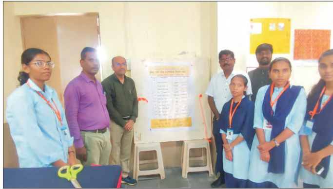
Inauguration of Students' Forum