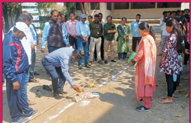
Inauguration of Sports programme