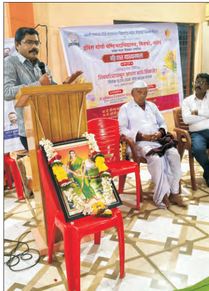
NSS programme at Mugat