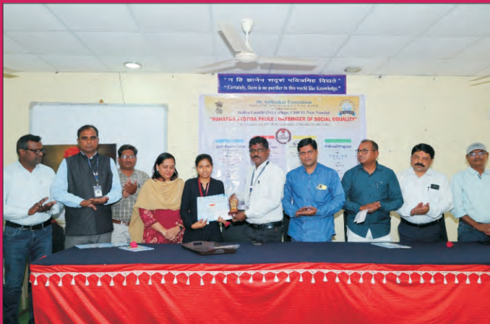
Prize Distribution of Competition held on Occasion of Birth Anniversary of Mahatma Jyotiba Phule (11 th April 2026)